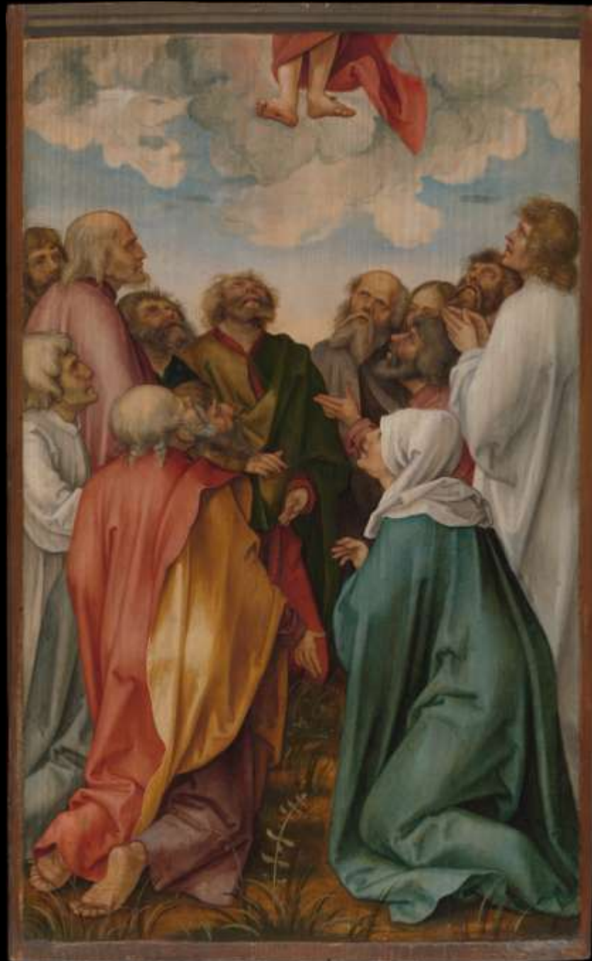
On Display at the New York Metropolitan Museum of Art